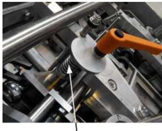
Hole punch installed in trimmer