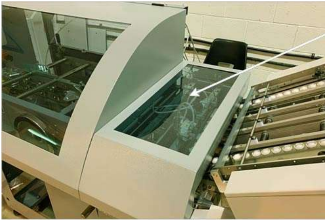
DMP Dynamic Perforation Unit mounted between the infeed conveyor and the scoring module

The DMP-100 comes with 2 perforation rotary knives and the DMP-101 has 4 perforation rotary knives. Each rotary knife is activated by a single extra digit in the standard IBIS sheet barcode, so that each side of the sheet can be perforated (or not) on command. A variety of different perforation rotary knives are available ranging from micro-perf, up to a very coarse perf. The DMP makes it easy to incorporate selective "pull-out" sheets into the finished booklet.