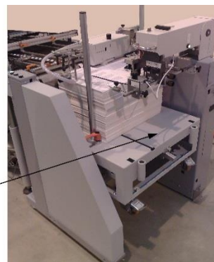
Trolley engaged with sheet feeder

Trolley now becomes the sheet 'pile lift table' and rises automatically as sheets are fed from the top of the pile.