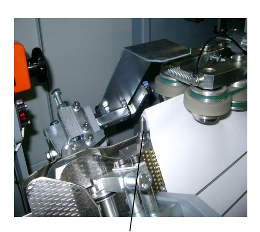
ISG Cold-Glue application nozzle on the Smart-binder